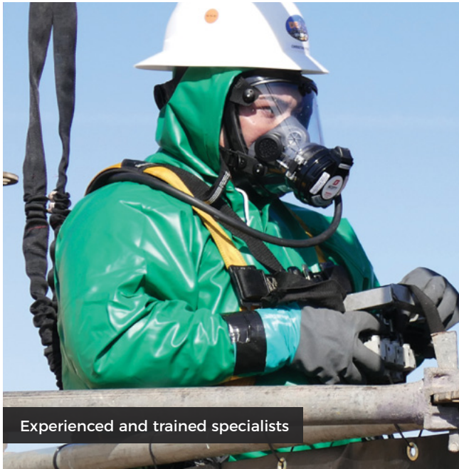
Experienced and trained specialists