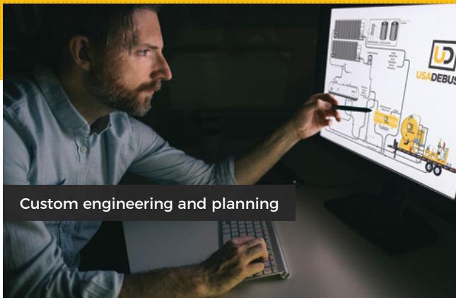
Custom engineering and planning