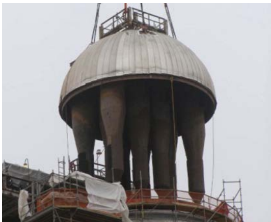
Regeneration unit head removal after hydro cutting