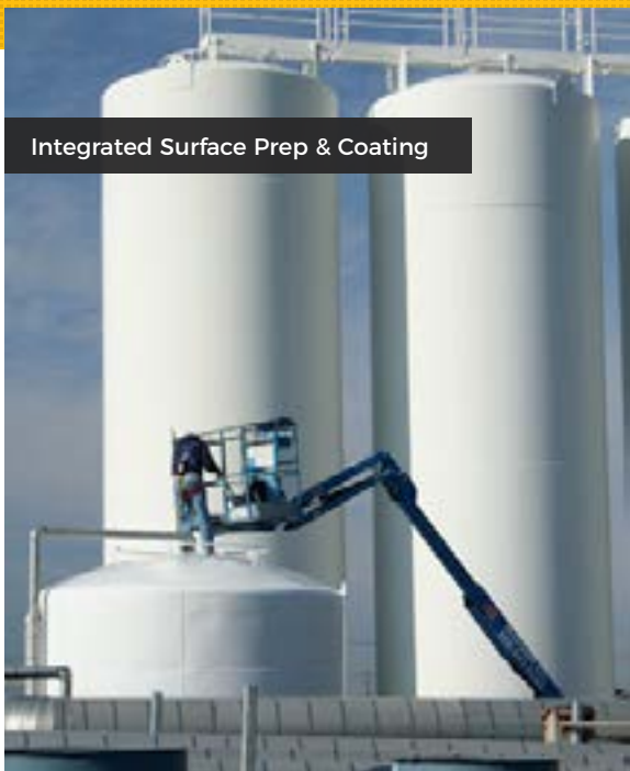
Integrated Surface Prep & Coating