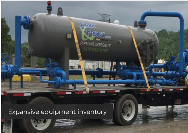
Expansive equipment inventory