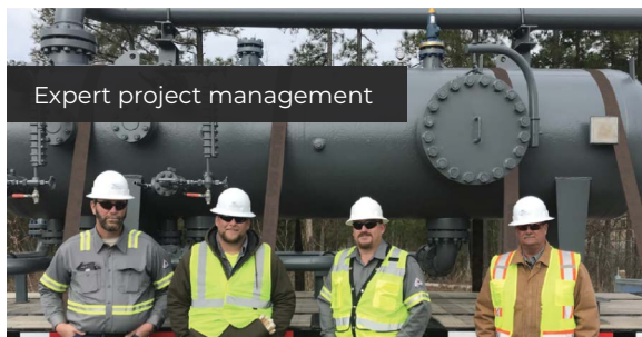
Expert project management

Farr Front, a USA DeBusk company, provides turnkey pipeline integrity services to improve safety, compliance, and operational efficiency. We offer end-to-end services, with advanced technologies, purpose-built specialty systems and rental equipment, experienced project management, and an uncompromising commitment to safety.