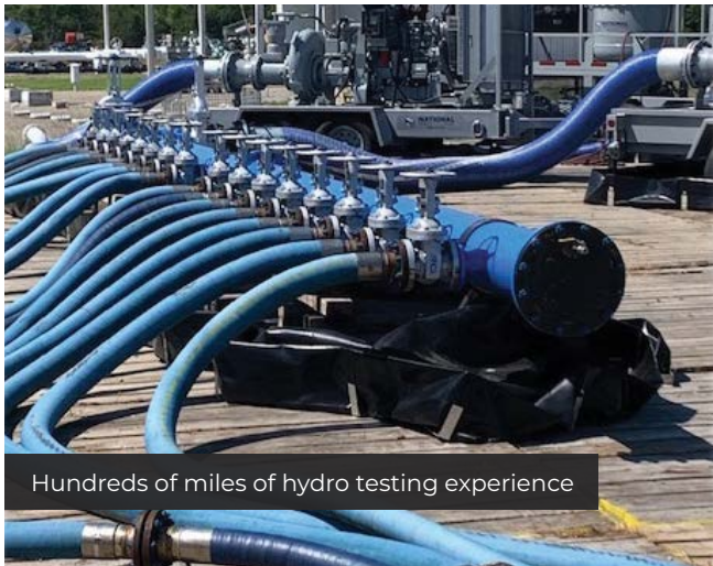
Hundreds of miles of hydro testing experience