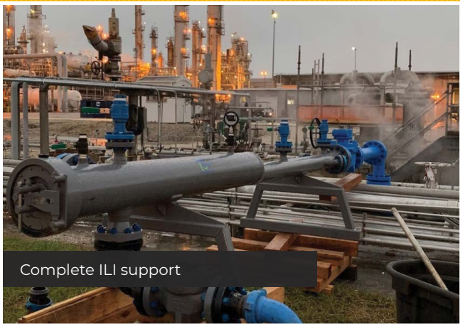
Complete ILI support