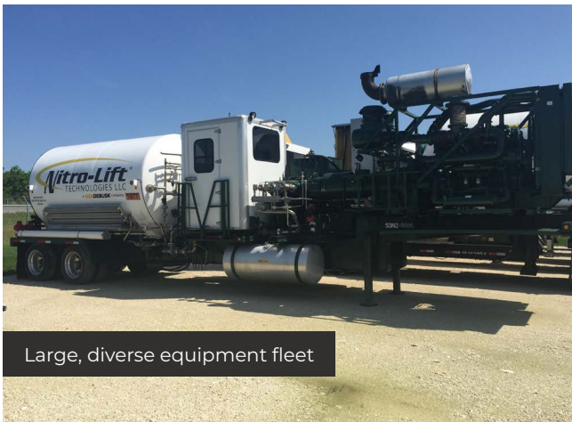
Large, diverse equipment fleet