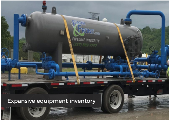
Expansive equipment inventory