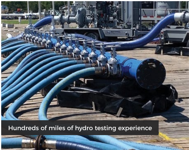
Hundreds of miles of hydro testing experience