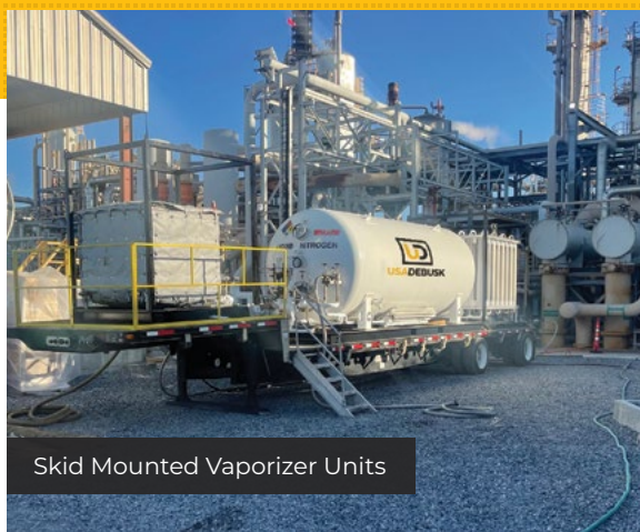
Skid Mounted Vaporizer Units

USA DeBusk provides nitrogen services for customer plant or field operations, as well as for integrated support of complementary services.