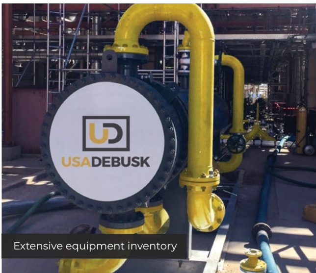
Extensive equipment inventory