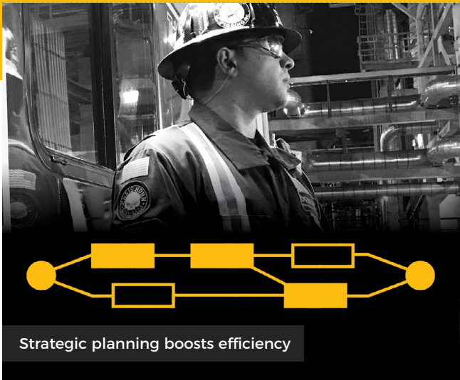
Strategic planning boosts efficiency