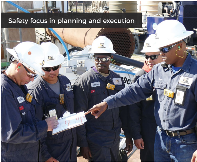
Safety focus in planning and execution